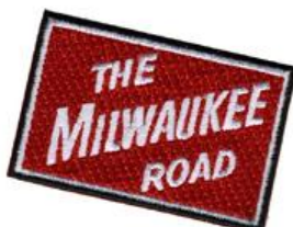
Milwaukee Road P-MRH 2-5/8" Horizontal