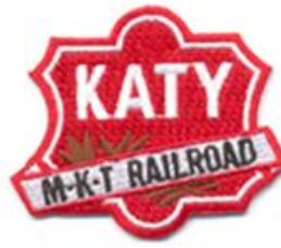
KATY P-KATY 2-1/4" Horizontal