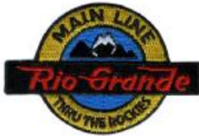
Rio Grande P-RGH 2-5/8" Horizontal