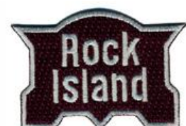
Rock Island P-RIH 2-1/4" Horizontal