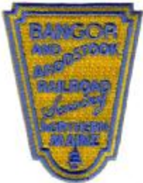
Bangor & Aroostook P-BARH 2-3/8" Vertical