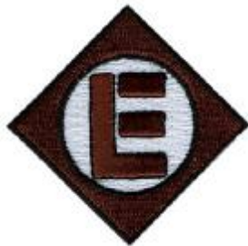
Erie-Lackawanna P-ELH 2-1/2" Horizontal