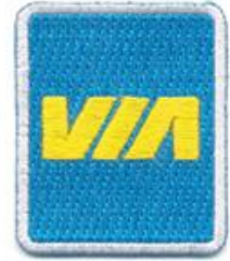
VIA P-VIA 2" Vertical