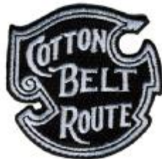
Cotton Belt Route P-CBRB 2" Diameter