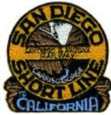
San Diego Shortline P-SDAH 2" Horizontal