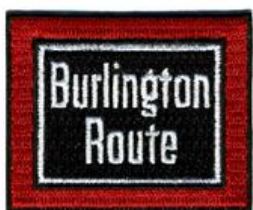
Burlington Route P-BRH 2-1/4" Horizontal