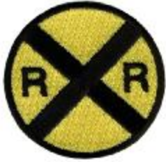
Railroad Crossing Sign P-RRXR 2" Diameter