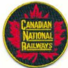
Canadian National P-CN 2" Diameter