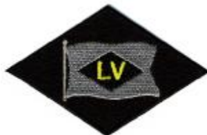
Lehigh Valley P-LVH 3" Horizontal