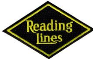
Reading Lines P-RLH 3" Horizontal