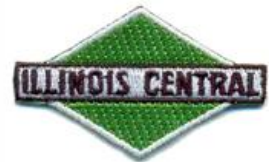
Illinois Central P-ICHW 2-1/2 Horizontal