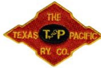
Texas and Pacific P-TPH 3" Horizontal