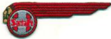
Santa Fe Indian P-SFI 3-1/4" Horizontal