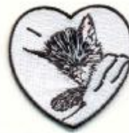
Chessie in heart P-CHEC 2" Horizontal