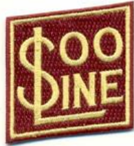
Soo Line P-SOOH 2" Horizontal